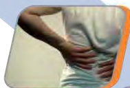
Low Back Pain